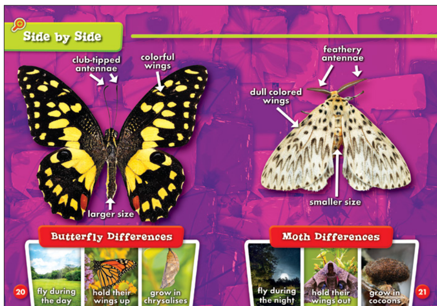
Sample spread from Butterfly or Moth?